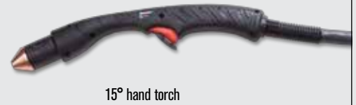
15° hand torch