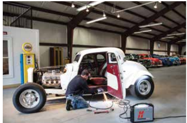
Vehicle repair and modification