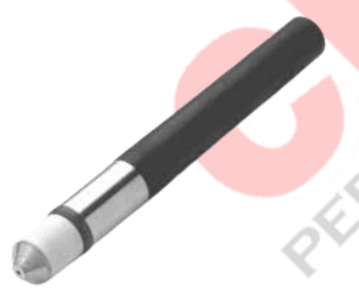
128365 – Stainless steel body