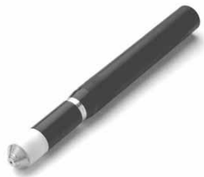
128380 – Standard body (Standard body – 2" sleeve)