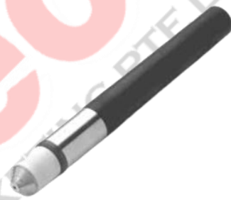
128365 – Stainless steel body